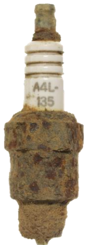
Composite: Spark Plug (Ceramic and Metal)